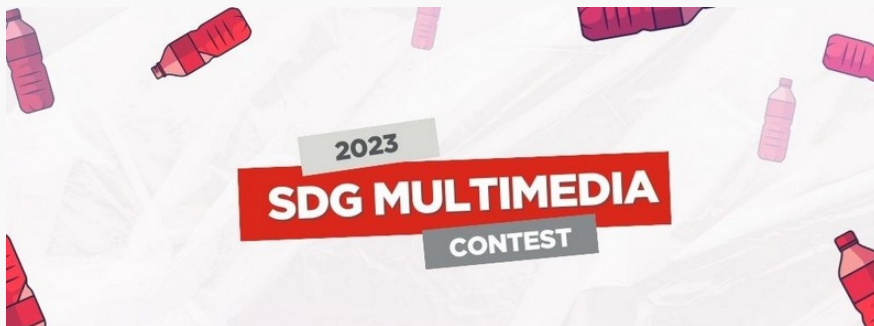
Caption: SDG Multimedia Contest poster.

The event aims to recognize and celebrate the outstanding achievements of our students who have demonstrated their knowledge of sustainability in business. Students were invited to create a poster, and share an innovative idea from another country that they think Canada and its businesses and entrepreneurs should implement to reduce, reuse or repurpose plastics. For more information, please visit the PRME SDG Multimedia Contest page .