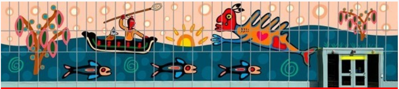
Caption: Artwork by Isaac Murdoch, "The Petition to the Water Spirits", located at Seneca@York Courtyard.

Looking for support? Feel free to reach out to the CI team at any time by emailing teaching@senecacollege.ca .