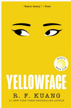
Caption: Book cover of Yellowface by R.F. Kuang.

If you're looking for a great holiday gift, consider this 2023 award-winning and bestselling novel, Yellowface by R.F. Kuang . An electric satire about racial identity in the trade publishing world, Yellowface is thought-provoking and at times, acidly funny. We encourage you to use our Yellowface Curriculum Integration book study as a guide (scroll down to Attachments section). Happy reading!