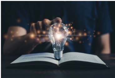
Caption: A lit, upright lightbulb on an open book.

Universal Design for Learning (UDL) is integral for authentic course design. With UDL, educators consider three principles: multiple means of engagement, representation and action and expression. Many professors already acknowledge the diversity of learners in the classroom, but UDL furthers this by placing student lived experiences at the forefront of engagement. Examples of UDL practices include less lecturing and concept checking via tests and quizzes with more emphasis on creating experiential activities and assessments. For example, are final projects essay-based questions or can they be reconfigured, so students choose various submission formats that suit their abilities? Or can students share personal reflections in their submissions as long as learning outcomes are being met? By reflecting on UDL and implementing it throughout course design, educators advance Seneca's Curriculum Integration journey.