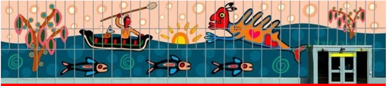
Caption: Artwork by Isaac Murdoch, "The Petition to the Water Spirits", located at Seneca@York Courtyard.

Looking for support? Feel free to reach out to the CI team at any time by emailing teaching@senecapolytechnic.ca .