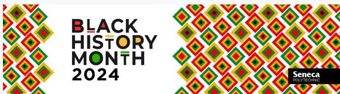
Caption: Black History Month 2024 banner.

Learn about these events and more by visiting the Black History Month space .