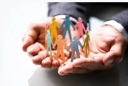
Caption: Image of hand holding a paper cutting in a shape that people holding hands in circles.

I am sharing the trailer from Lido TV , a CBC web series created by Grammy-nominated artist, Lido Pimienta . Sharing perspectives on colonialism, beauty, and feminism, through sketch comedy, puppetry, and musical performances, Pimienta makes room for humour and creativity in our shared responsibilities.