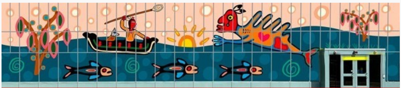
Caption: Artwork by Isaac Murdoch, "The Petition to the Water Spirits", located at Seneca@York Courtyard.

Looking for support? Feel free to reach out to the CI team at any time by emailing teaching@senecapolytechnic.ca .