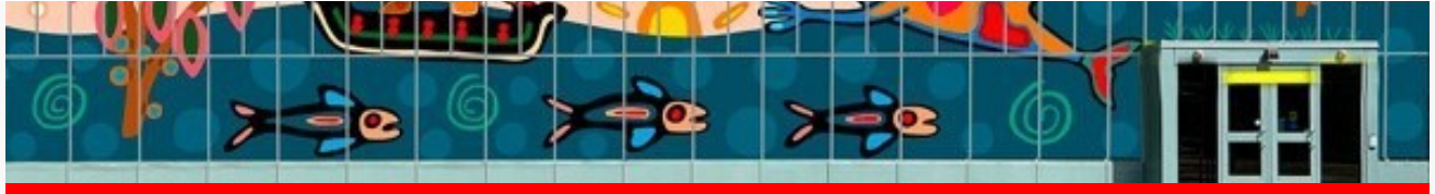
Caption: Artwork by Isaac Murdoch, "The Petition to the Water Spirits", located at Seneca@York Courtyard.