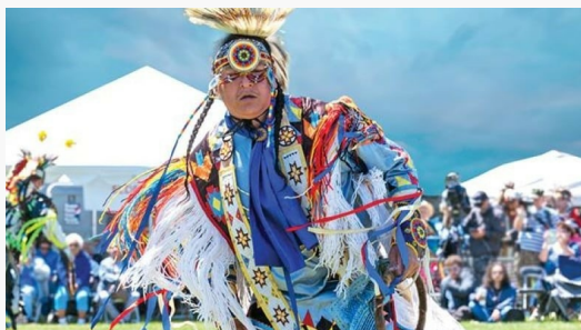
Caption: Powwow dancer in traditional dress.

Join us for a weekend of celebration, learning, and community spirit in the heart of Toronto!