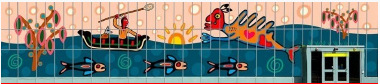
Caption: Artwork by Isaac Murdoch, "The Petition to the Water Spirits", located at Seneca@York Courtyard.

Looking for support? Feel free to reach out to the CI team at any time by emailing teaching@senecapolytechnic.ca .