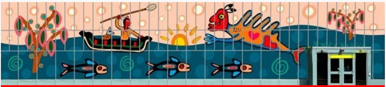
Caption: Artwork by Isaac Murdoch, "The Petition to the Water Spirits", located at Seneca@York Courtyard.

Looking for support? Feel free to reach out to the CI team at any time by emailing teaching@senecapolytechnic.ca .