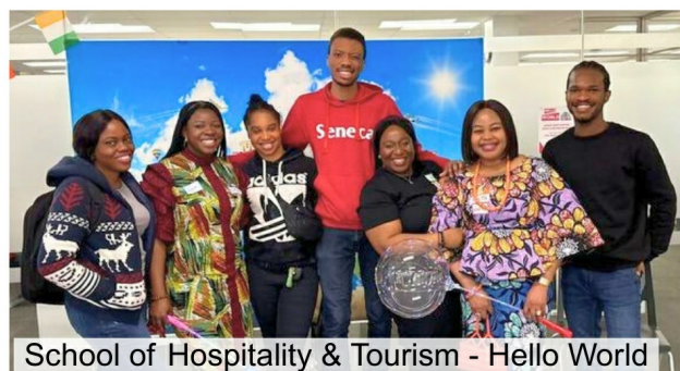
School of Hospitality & Tourism - Hello World