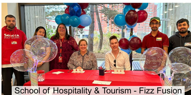
School of Hospitality & Tourism - Fizz Fusion