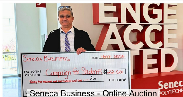
Seneca Business - Online Auction

On behalf of the entire Seneca community: thank you . You've shown what's possible when we come together to support our students.