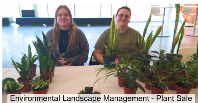
Environmental Landscape Management - Plant Sale