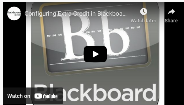
Configuring Extra Credit video

View an excellent, comprehensive video on using the Grade Centre to add extra credit below: